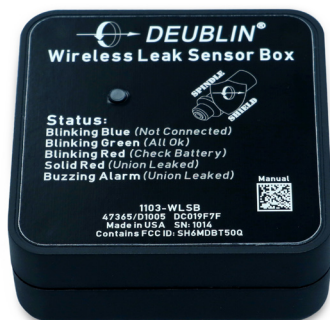
Wireless Leak Sensor Box, Alarm Unit

Typical Coolant Union featuring SpindleShield® works in conjunction with Wireless Leak Sensor Box