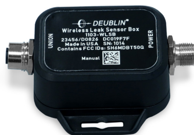
Wireless Leak Sensor Box, Detection Unit